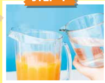
Mix equal amounts of fruit juice and water.