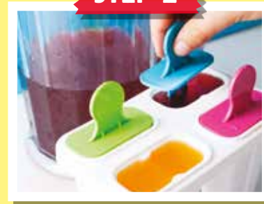
Pour into ice lolly moulds. Freeze. Wait for a really hot day and enjoy!