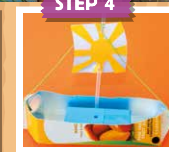
STEP 4 Punch a hole at the top and bottom of the sail and weave the straw or stick through the holes. Wrap string around the top of the straw and tape each end of the string to each end of the boat. Now your boat is ready to race!