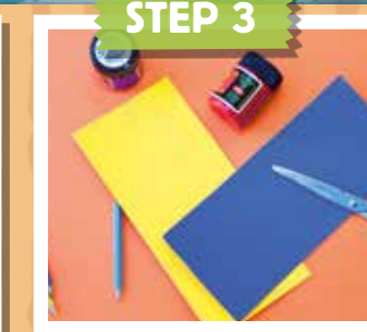
STEP 3 Cut out a square piece of paper or fabric about three quarters of the length of the straw. This will be the sail. Decorate the sail with paint, markers and stickers.