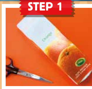
STEP 1 Cut the carton in half lengthwise. Pinch both ends with your fingers to make each end pointy.