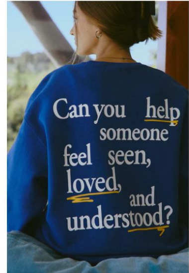
Human Connect Crewneck