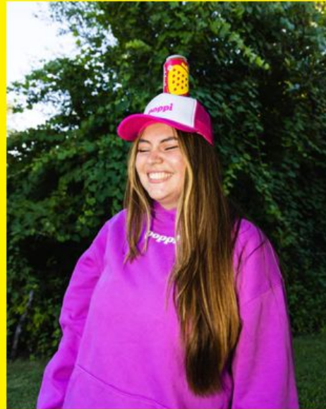
#BFE Trucker — $30