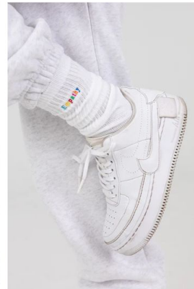
EMPATHY ALWAYS Socks