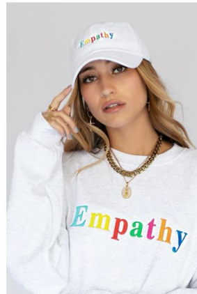
EMPATHY ALWAYS Hat