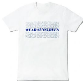
Wear Sunscreen Tee