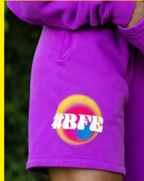
#BFE Shorts — $70