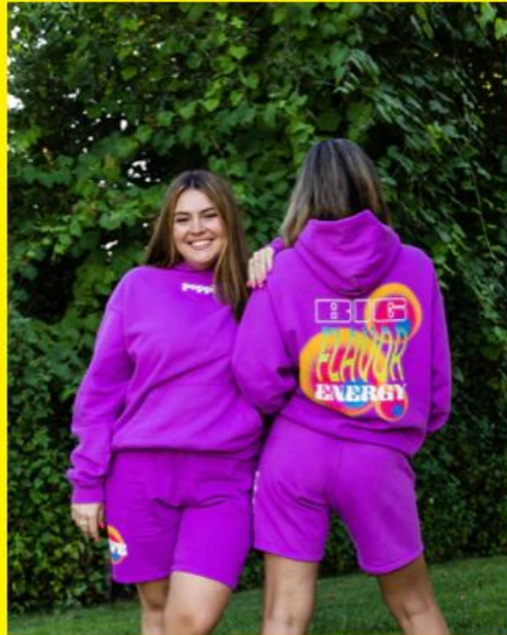
#BFE Hoodie — $80

Pop. Sip. All New Drip. As high quality as our ingredients and fresh as our flavor, you'll be sure to be serving #BFE all season long.