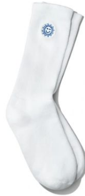
Smiley Cotton Tube Socks $16