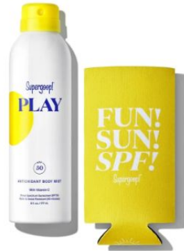
PLAY Body Mist & Coozie Set $21