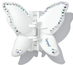
Butterfly Hair Clip

Every Single Day Wear Sunscreen FUN! SPF!