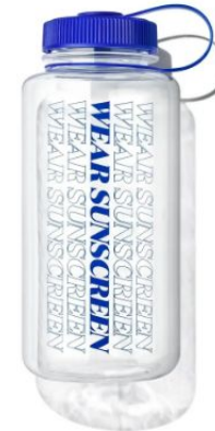
Wear Sunscreen Reusable Water Bottle $20

Every Single Day Wear Sunscreen FUN! SPF!