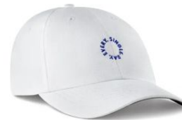
Every. Single. Day.™ Baseball Cap