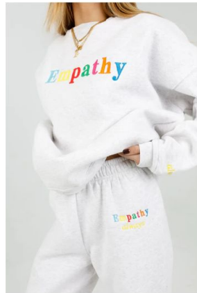
EMPATHY ALWAYS Grey Sweatpants