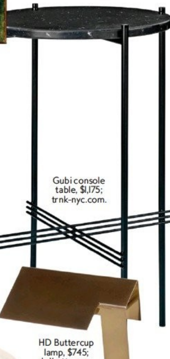
Gubi console table, $1,175; trnk-nyc.com.