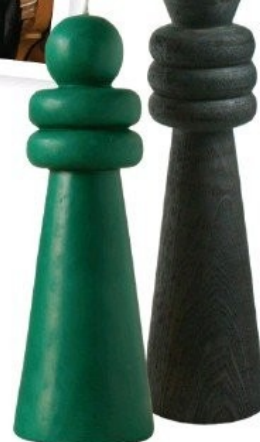
Carl Durkow candle ($42) and candlestick ($150, white candle not included); carldurkow.com.