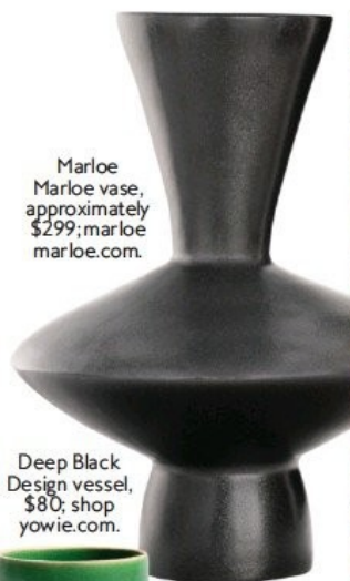
Marloe Marloe vase, approximately $299; marloe marloe.com.