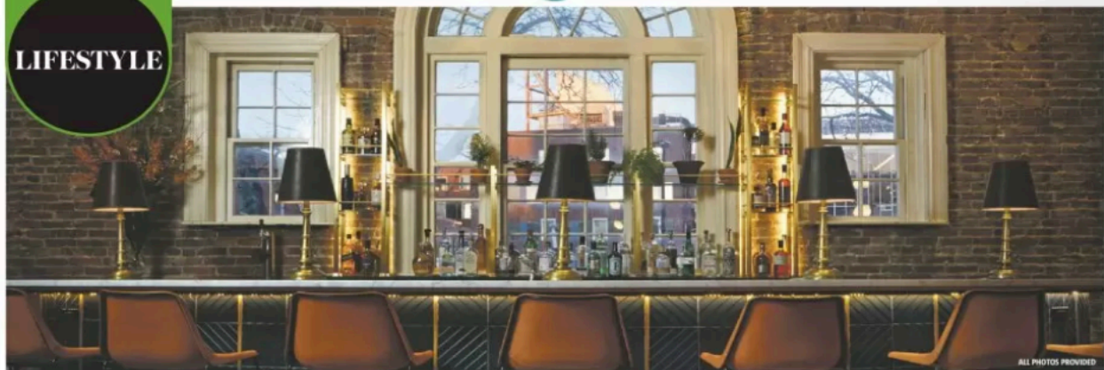
ALL PHOTOS PROVIDED